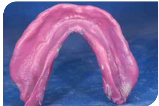
Edentulous Mandibular Impression